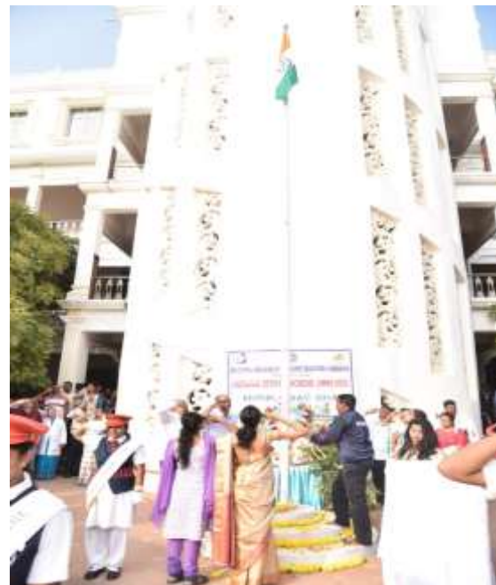
FLAG HOISTING CEREMONY AT 8:30AM