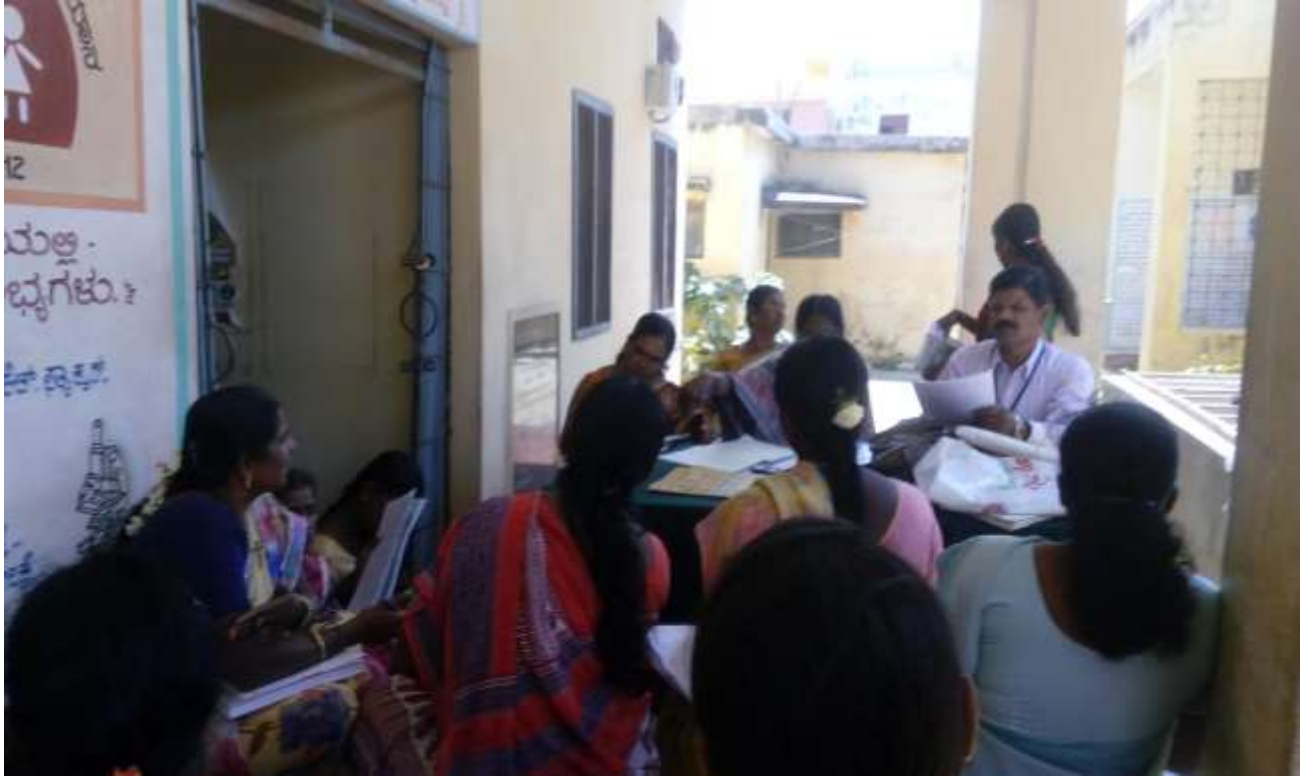
Discussion with Shree Shakti group