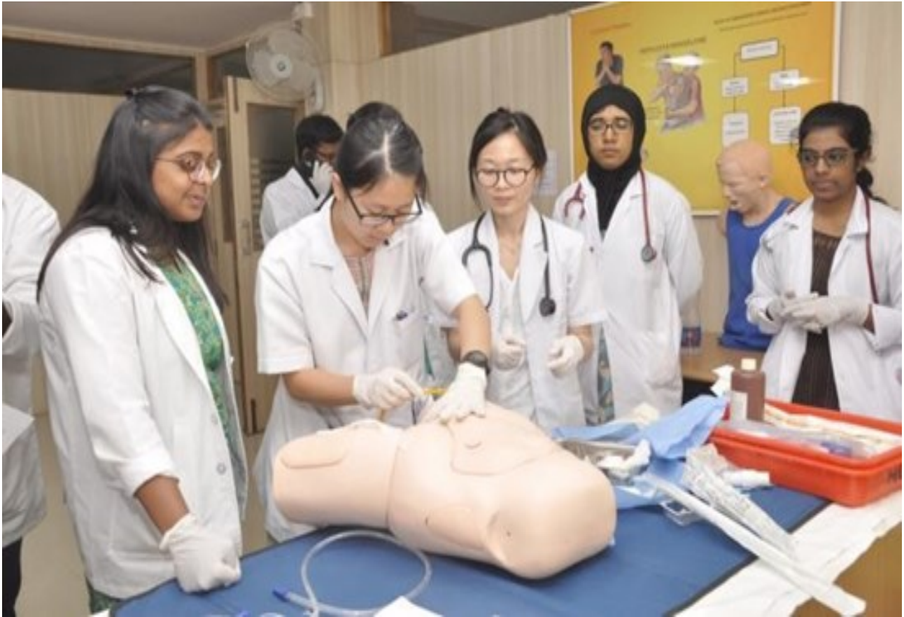
Dept. of Microbiology conducted hands-on workshop on "Infection control practices" for Interns ( 2012 batch) at Skill Lab , SDUAHER : 18 th &19 th January 2017.