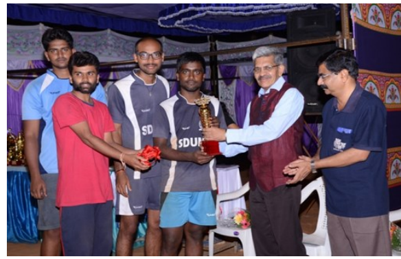
"FUN MELA 2017" Volleyball (M) Winners