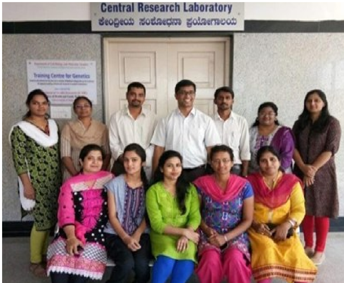
2nd National Training programme: Techniques in Genetics conducted by Department of Cell Biology and Molecular Genetics (CBMG) 20 th March – 19 th April 2017