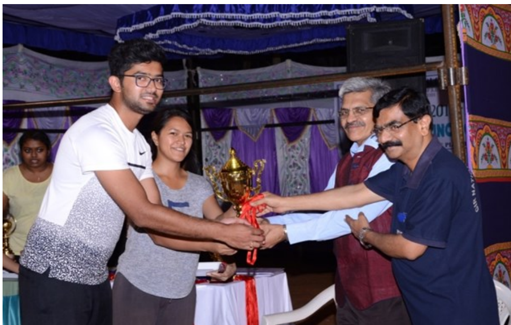
"FUN MELA 2017" Tennis (Mixed) Winners