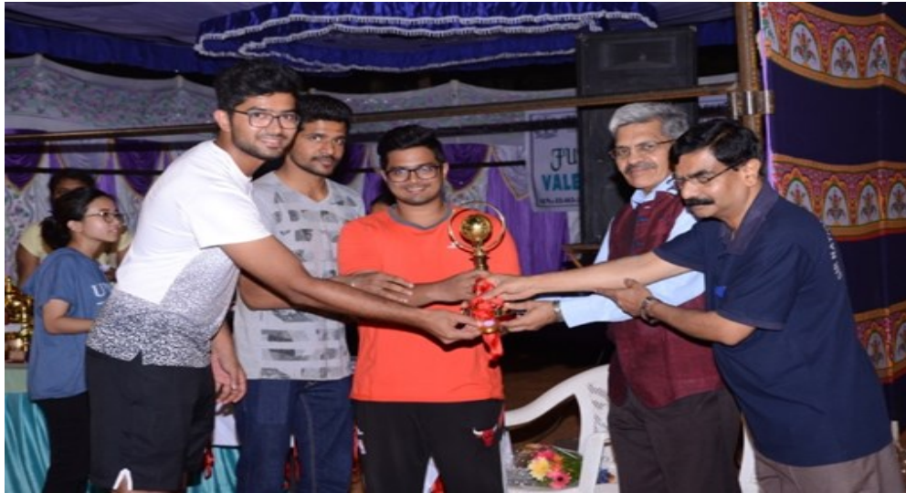
"FUN MELA 2017" Badminton (M) Winners (Doubles)