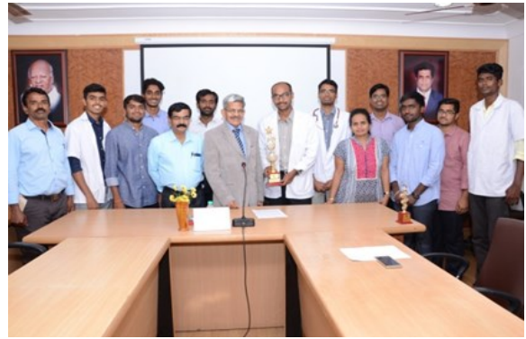
Runners of Volleyball (M) at "INVICTUS-2017" KMC Manipal along with officers of the Academy.