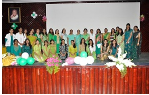
Women Empowerment Cell, SDUAHER Members and students on International Women's Day on 8 th March 2017.