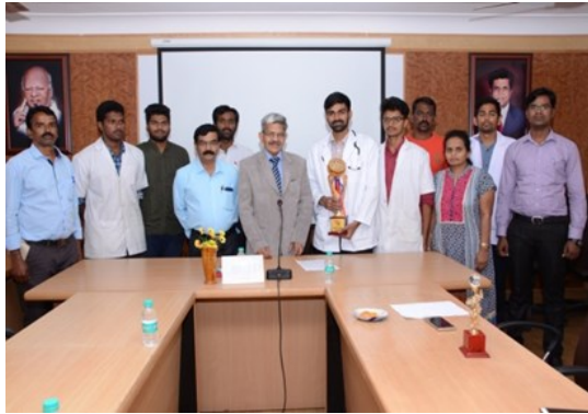
Winners of Basketball (M) at "INVICTUS-2017" KMC Manipal along with officers of the Academy .