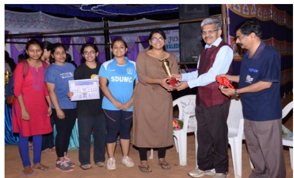
"FUN MELA 2017" Volleyball (W) Winners