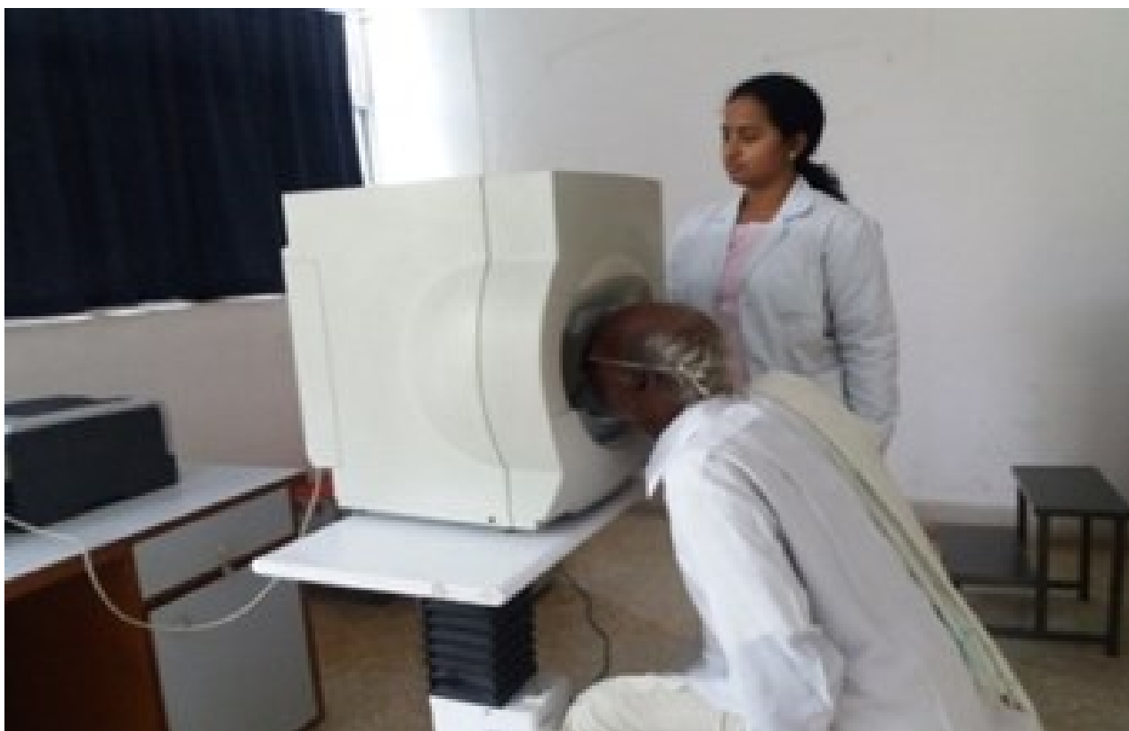
WORLD GLAUCOMA WEEK was observed by Dept. of Ophthalmology from 10 th to 16 th of March 2017. Awareness programs about Glaucoma were held at Sugutur & Holluru villages near Kolar. 13 th March 2017