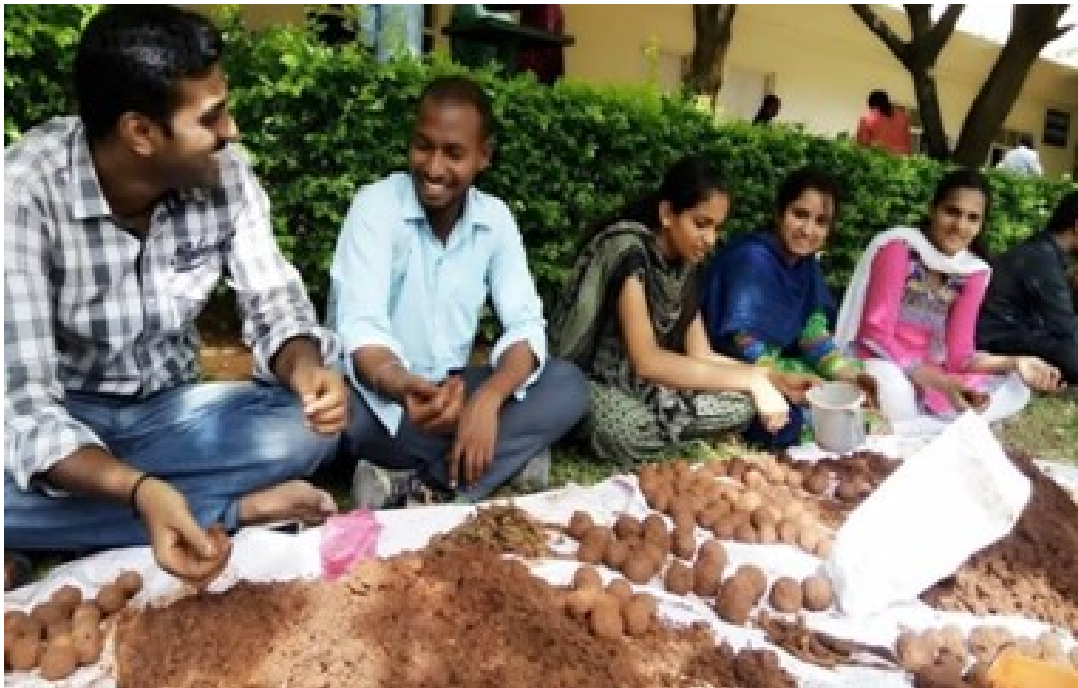
As an interdisciplinary activity, Dept. of Cell Biology and Molecular Genetics, joined NSS organizers on World Environment Day, May 5, 2017. Volunteers worked hand in hand in distributing saplings and making seed balls