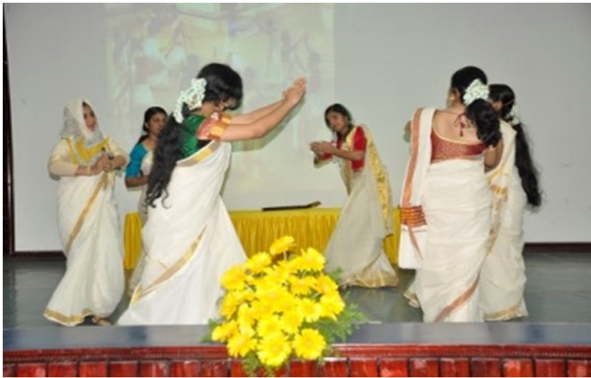
Dance by MBBS students (2016 batch) representing Kerala Culture on the occasion of Mathrubhasha Diwas