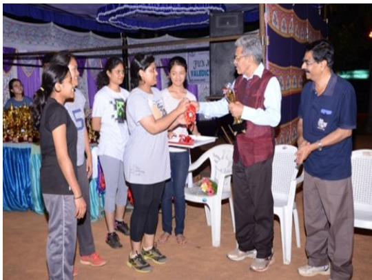
"FUN MELA 2017" a sports and cultural program organized by students of SDUMC. Throw ball (W) Winners along with Hon'ble Vice chancellor and Principal of SDUMC.