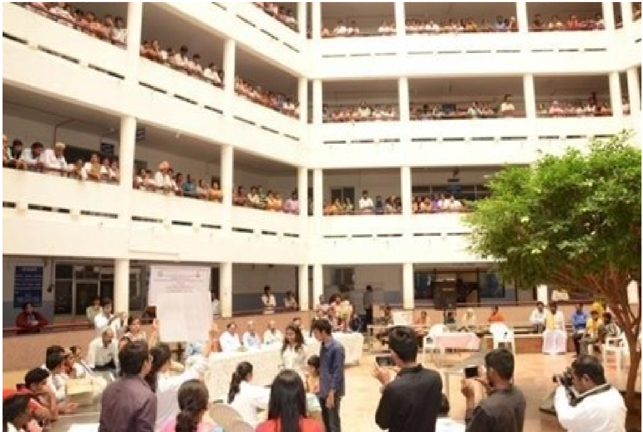
International Day Against Drug Abuse and Illicit Trafficking, observed by Dept. of Psychiatry on 27 th June 2017. Students of SDUMC creating awareness by performing street play at RLJH&RC quadrangle