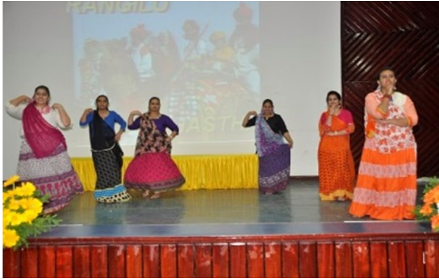
Dance by MBBS students (2016 batch) representing Rajasthan Culture on the occasion of Mathrubhasha Diwas