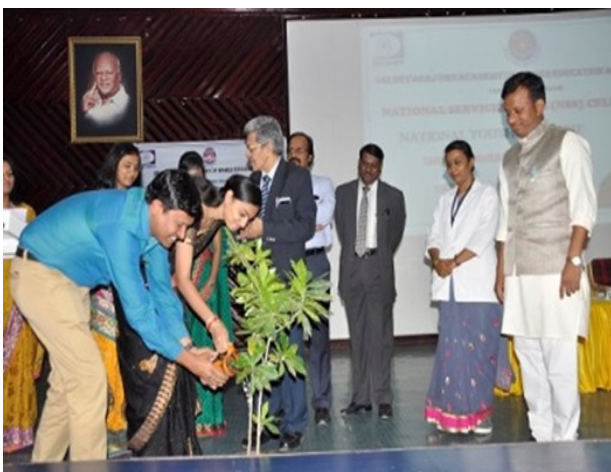
Inauguration of National Youth Day 12 th January 2017