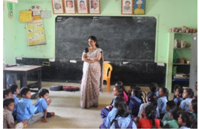
Annual special camp activities as a part of NSS was organised in Shettykothanur village as a week long programme from 3 rd to 9 th April 2017.