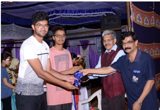
"FUN MELA 2017" Basketball (M) Winners