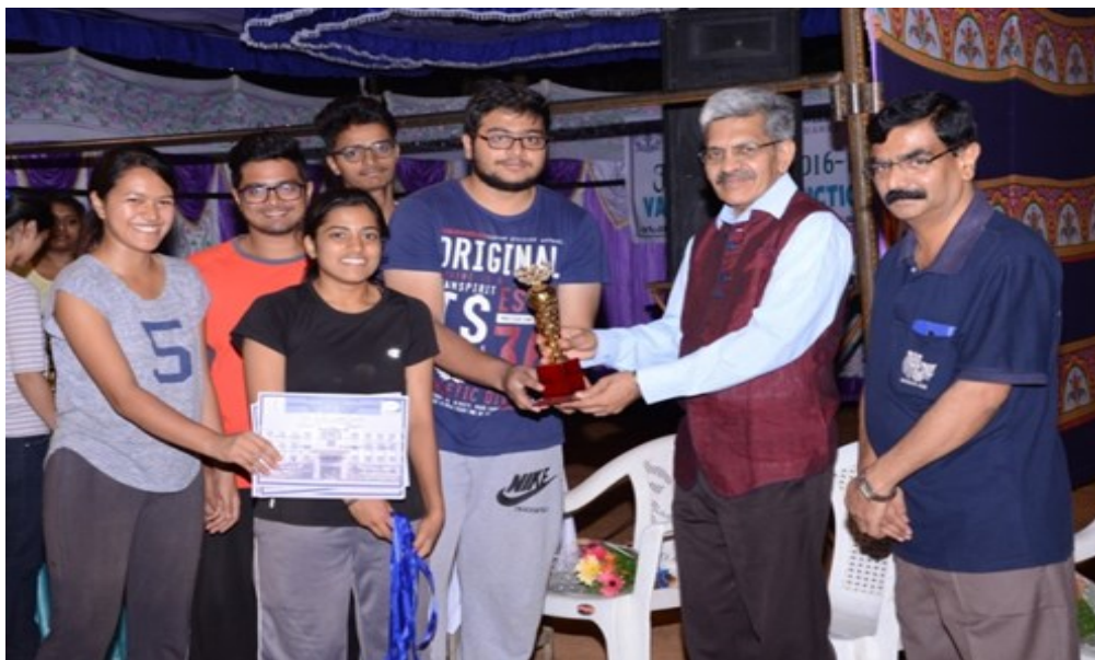
"FUN MELA 2017" Volleyball (Mixed) Runners up