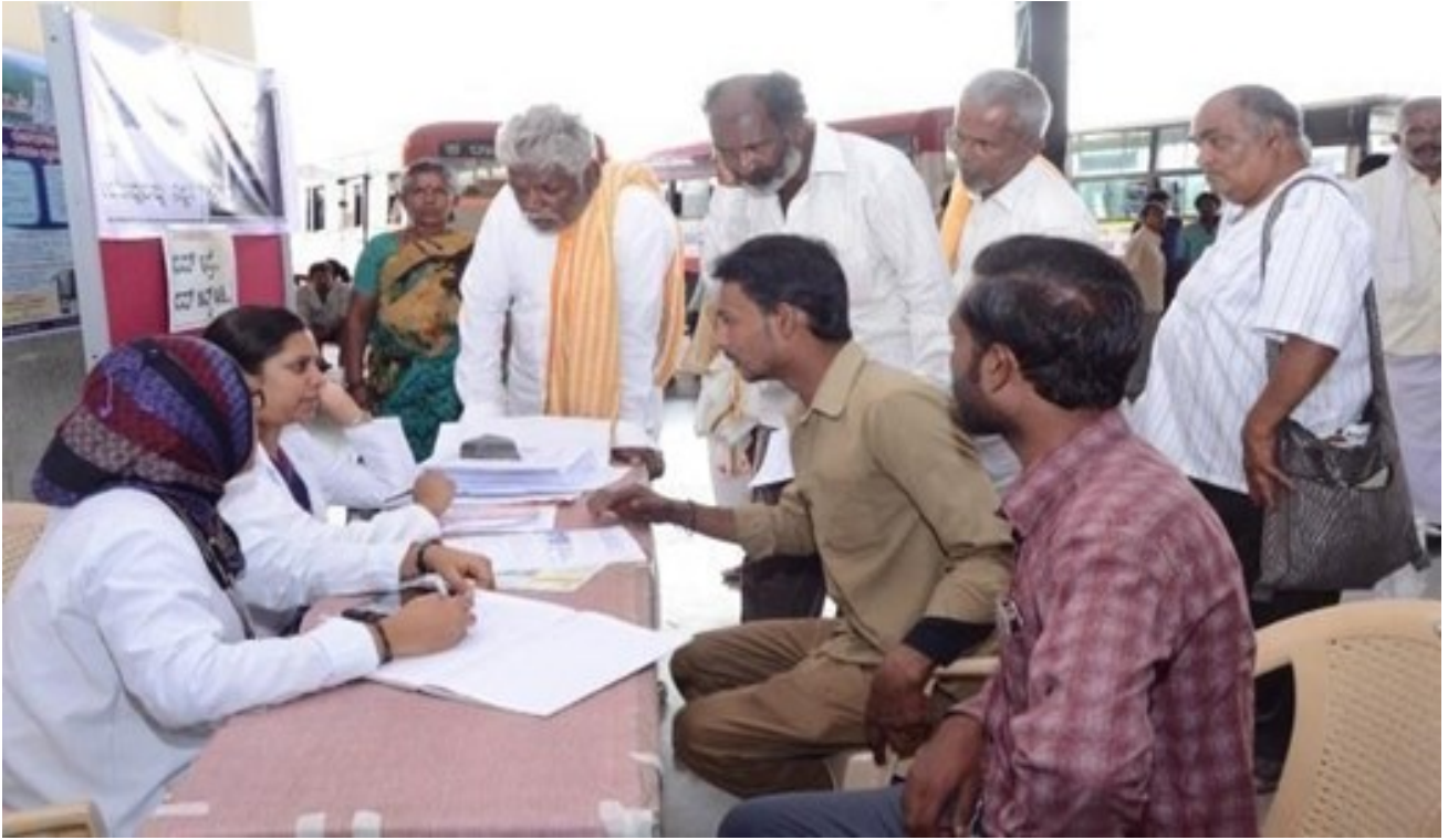
World No Tobacco Day was observed by Dept .of Community Medicine on 31 st May 2017. Theme: Tobacco – A Threat to Development. Doctors spreading awareness among public