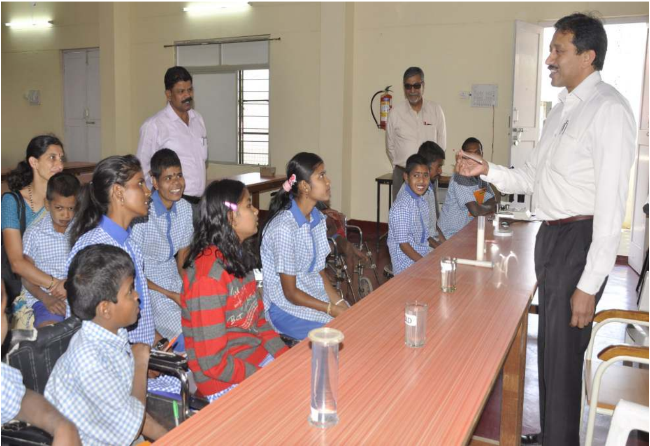
National Science Day Celebration .