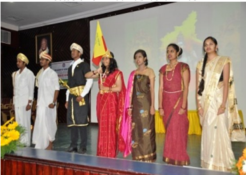
Fashion show by MBBS students (2016 batch) on Mathrubhasha Diwas