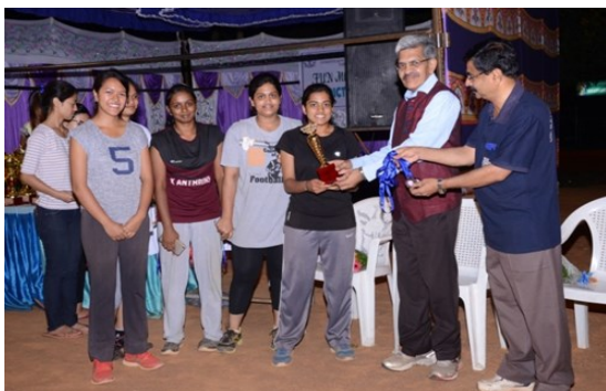
"FUN MELA 2017" Volleyball (W) Runners up