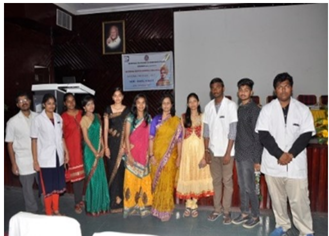
Organizing Committee of National Youth Day 12 th January 2017