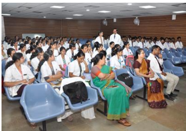
Revised Basic Course Workshop in Medical Education Technologies for Faculty with MCI Observer