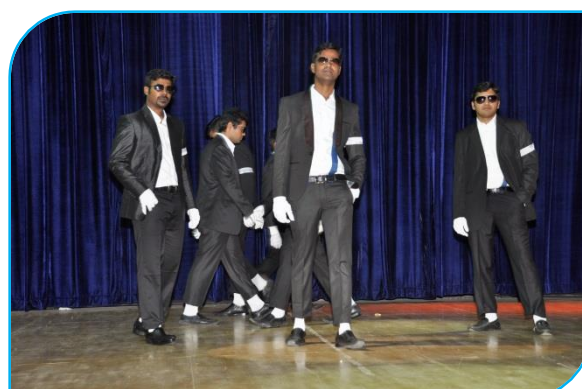
Fashion show by the Faculty Department of Surgery on the occasion of PARVA - 2016