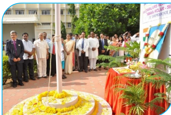
Independence Day Celebration on 15 th August 2016 in the SDUMC campus