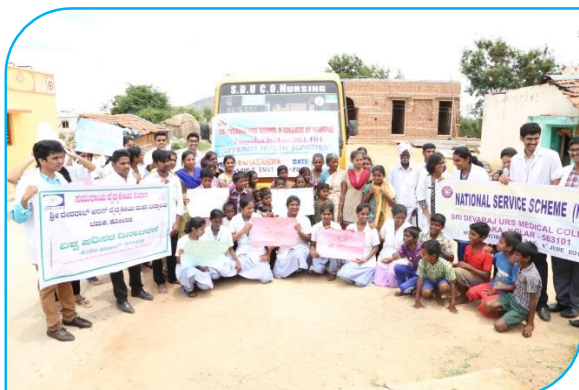
World Environment Day on 5 th June 2016