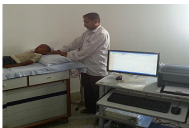
EEG Clinic: Biofeedback