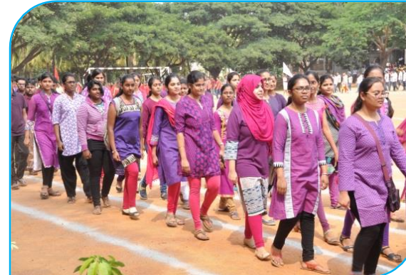
Students; contingent in purple dress marching past the flag post at the Annual Athletic Meet-2016