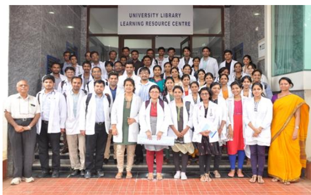
Orientation & Research Methodology Workshop for PGs 2016-17 batch on 8 th , 9 th & 10 th August 2016