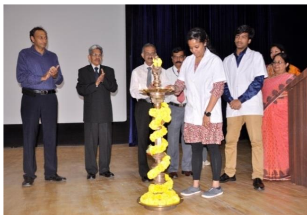
Workshop on "Competency Based Medical Education" for faculty on 03-09-2016