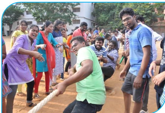
Students engaged in Tug of war