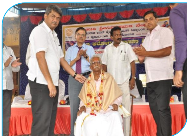
Felicitation of a Senior Citizen on the occasion of Free Health Camp on 3 rd May 2016 Srinivaspura