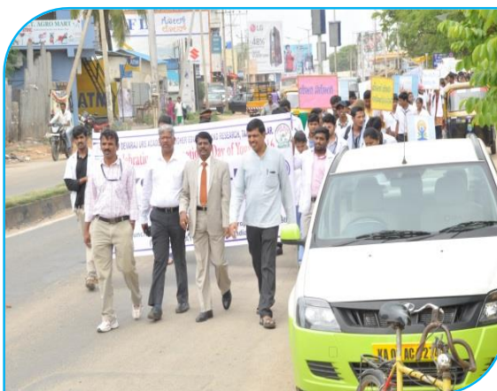
Felicitation of a Senior Citizen on the occasion of Free Health Camp on 3 rd May 2016 Srinivaspura