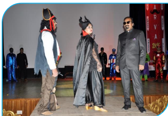
Fashion show by the Department of Surgery on the occasion of PARVA - 2016