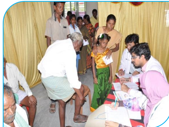
Free Health Camp organized on 16 th June 2016 at Hosur, Srinivaspura Taluk