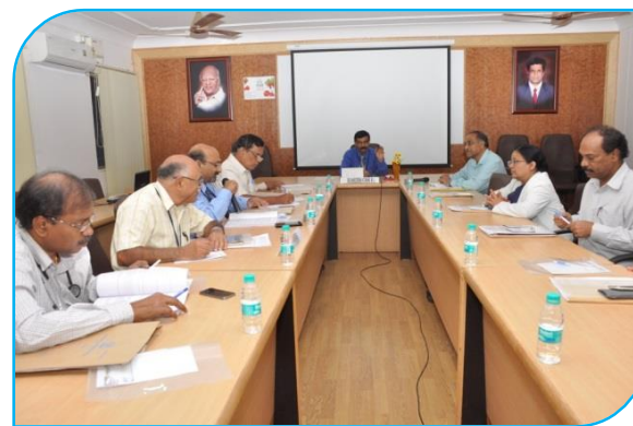
13 th Meeting of Faculties of Medicine and Allied Health Sciences held on 26 th February 2017