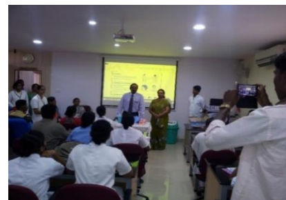
Hospital Acquired Infections Prevention & control practices