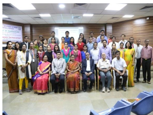
Group photo of CME on "Pharmacogenomics -Past, Present and Future" on 06-08-2016