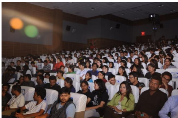
Auditorium of 1050 seating capacity at Library Information Center

being run by the department of Community Medicine.