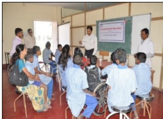
Demonstration of recording and reading of temperature to specially abled children on 'National Science Day'