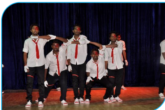
Dance Performance by the students on the occasion of PARVA - 2016