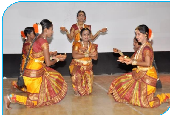
Group Dance Competition on the occasion of Hospital Day Celebration in progress