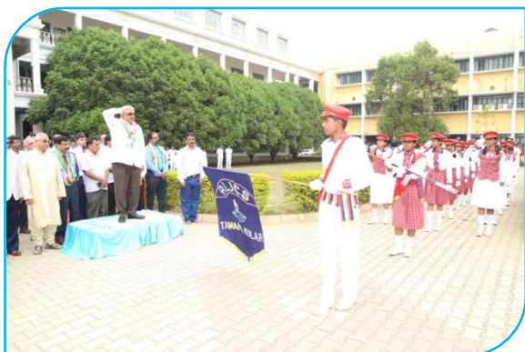
March past on Republic Day - 26 th January 2017