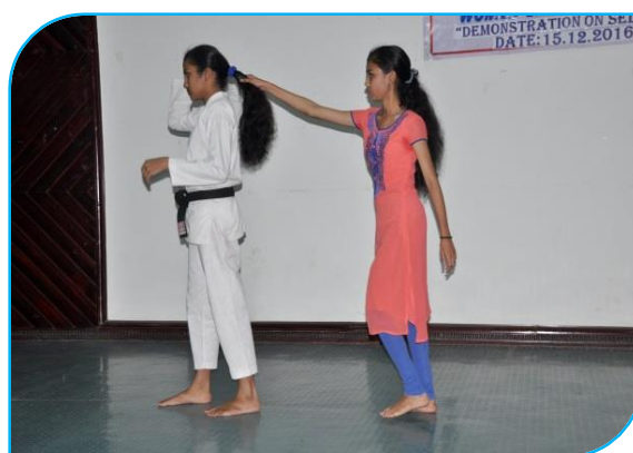
Role play in progress during Breast Feeding Week (1 st to 7 th August 2016) at RLJH & RC