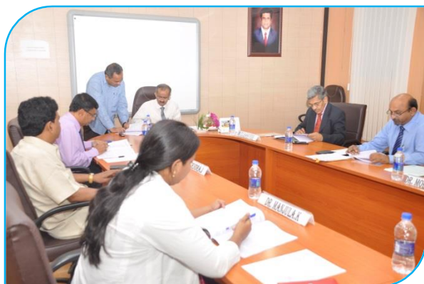
43 rd Board of Management Meeting on 23 rd March 2017