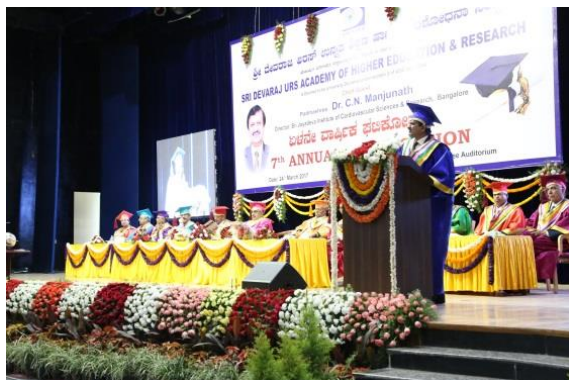
Chief Guest addressing the august gathering on 7 th Annual Convocation