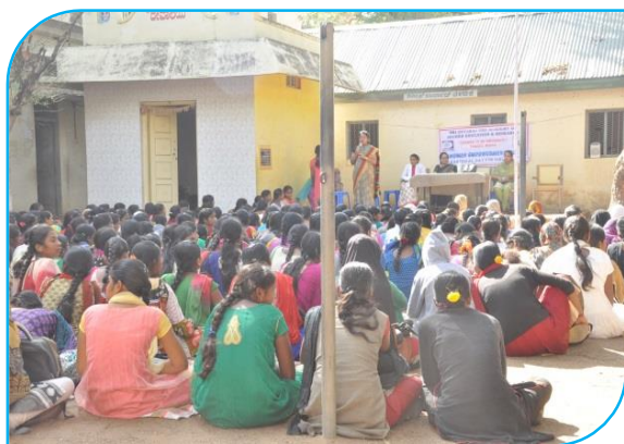
Celebration of International Day of Girl Child on 11 th December 2016