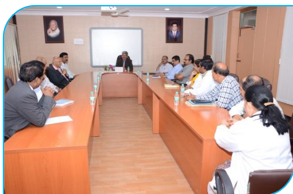
17 th Meeting of BOS – Allied Health Science Subjects held on 15 th February 2017