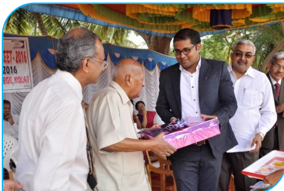
Hon'ble Chairman presenting memento to the Chief Guest for the Annual Athletic Meet - 2016