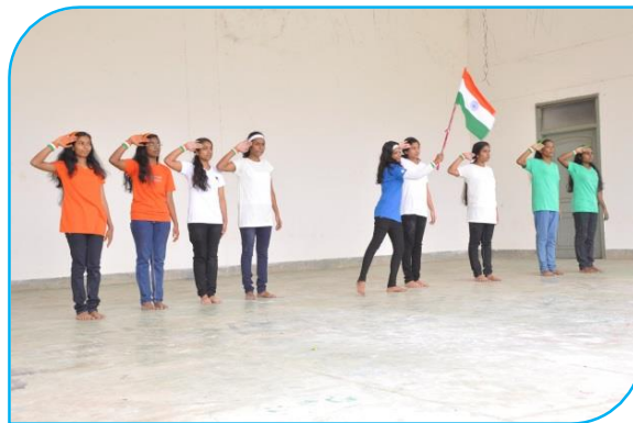
Republic Day Celebrations on 26 th January 2017