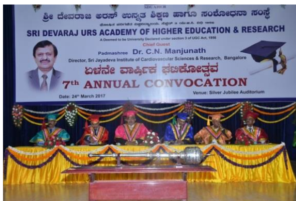
7 th Annual Convocation Ceremony in progress with all the Dignitaries on the Dais