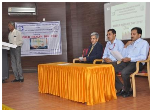
Celebration of World Health Day" function.