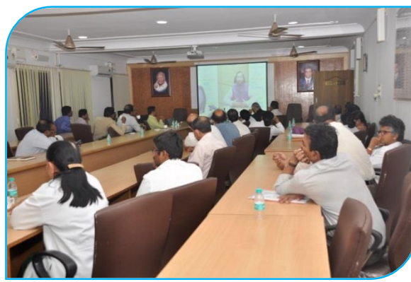
26 th Academic Council Meeting held on 3 rd March 2017