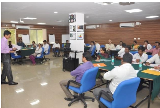
Orientation Course for II MBBS Students