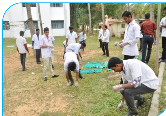
Swachh Bharath Mission at SDUAHER campus on 29 th August