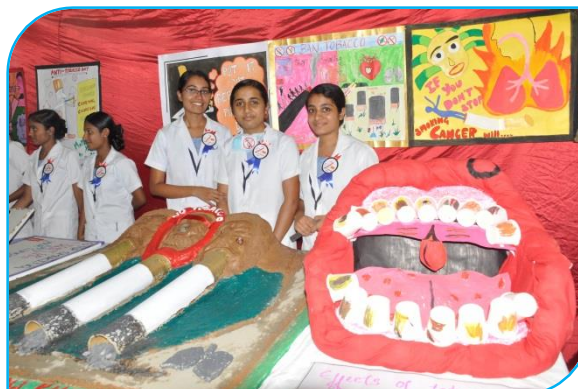
Awareness drive on World No Tobacco Day: 30 th May 2016