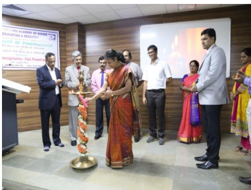
Inauguration of CME on "Pharmacogenomics -Past, Present and Future" on 06-08-2016