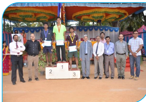
Prize distribution ceremony of Annual Athletic Meet - 2016