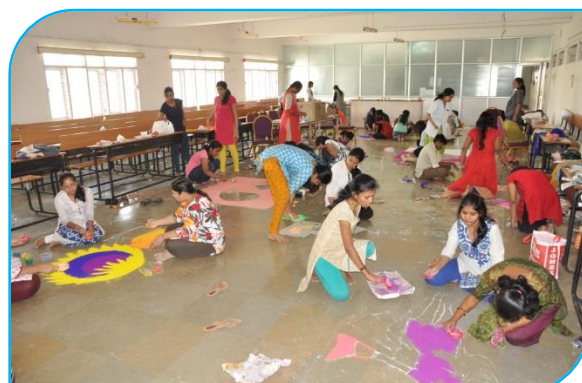
Rangoli Competition by the students on the occasion of PARVA - 2016