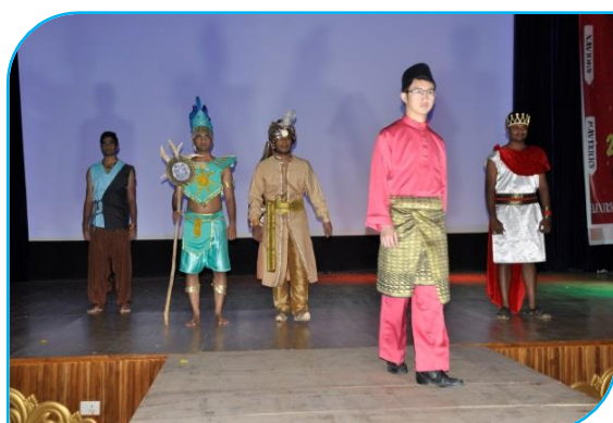
Fashion show by the students on the occasion of PARVA - 2016