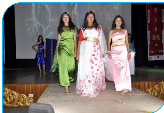
Fashion show by the students on the occasion of PARVA - 2016