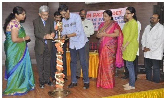
Inauguration and Lamp Lighting at Pathology CME conducted on 04 th March 2017