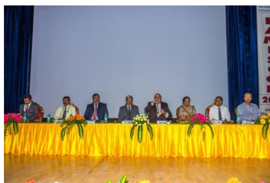
Inaugural ceremony of 24 th Annual State Level Conference of KAMLS

The 24th Annual State Level Conference of Karnataka Medico Legal Society (KAMLS) from 21st to 23rd December 2016 was hosted by the Dept with the Theme - "Forensic Medicine and Human Rights". Around 200 delegates from various parts of the country participated in the conference.