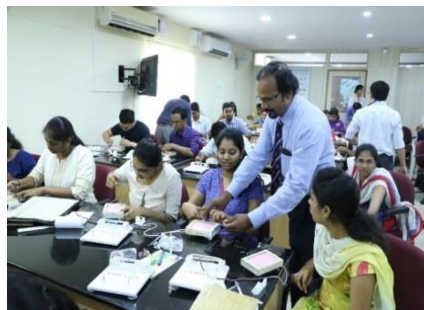
Basic Surgical skills