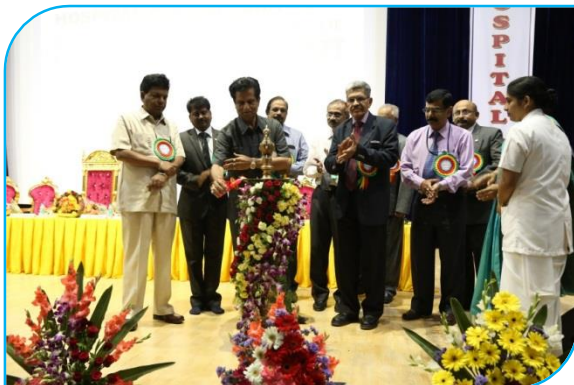
Inauguration of Hospital Day Celebration on 19 th October 2016 by Hon'ble Secretary, SDUET