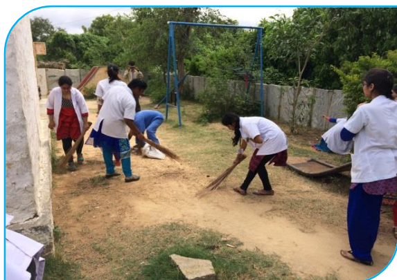
Swachhata Abhiyana at village Doddiganehalli on 29 th August 2016