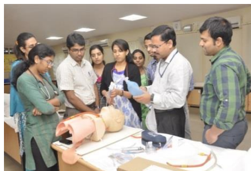
DLT / BLS workshop