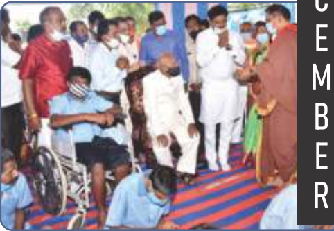
Inauguration of Antharganga Mentally Challenged Children's Residential School and Rehabilitation Centre