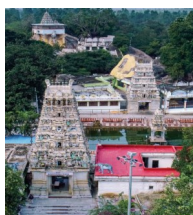
Banagru Thirupathi Temple Guttahalli (45Km)