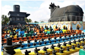
Koti Lingeshwara Temple Kammasandra (30Km)