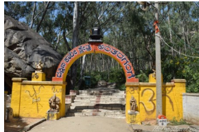
Antharagange Betta From Kolar (8Km)