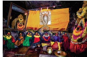
Kolaramma Temple From Kolar (3Km)