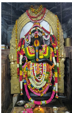
Vinayaka Temple Kurudumale (38Km)