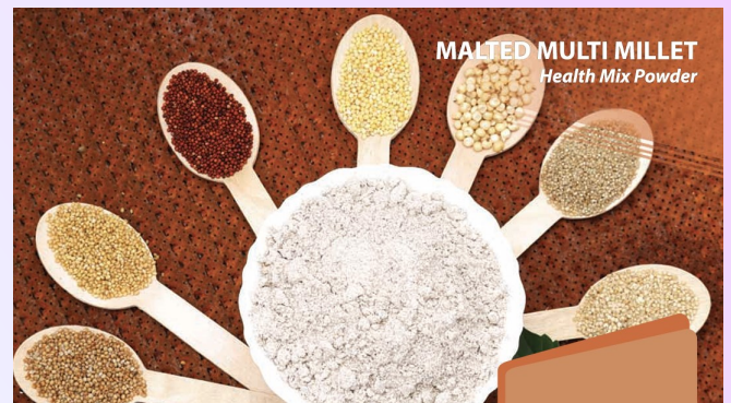
MALTED MULTI MILLET Health Mix Powder