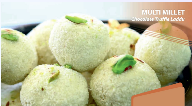
MULTI MILLET Chocolate Truffle Laddu