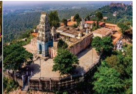
Markendeshwara Temple From Kolar (13Km)