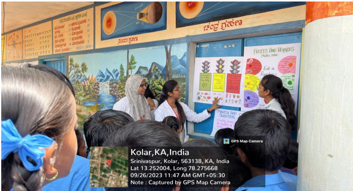
Poster display about nutrition awareness was carried out by PG students (2018 batch)