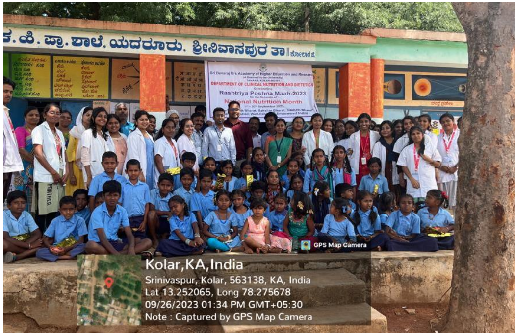
Group photo at Government Higher Primary School, Yedarur, Village

On the occasion of National Nutrition Month, different activities like seminars, games, educational events and poster display are carried out to educate students about the advantages of a balanced diet, benefits of proper nutrition, prevention of diseases caused by poor nutrition, and measures to overcome nutritional deficiencies.