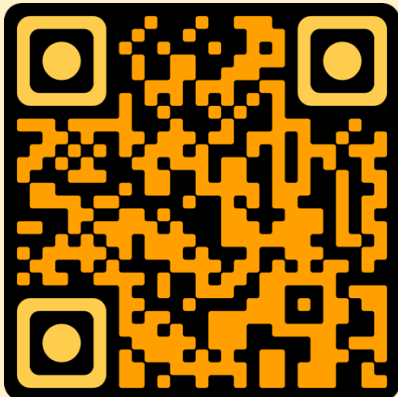
Scan or click here to submit