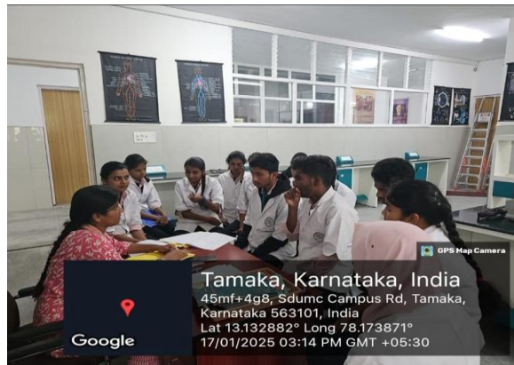
Human Anatomy and Physiology lab